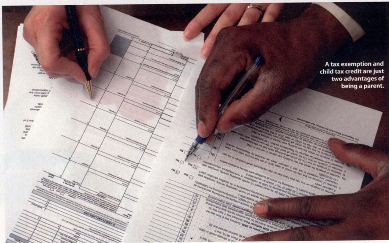
A tax exemption and child tax credit are just two advantages of being a parent.

and then fills out the form for you to sign with a witness present. However you do it, don't put it off. "Many parents over-think creating a will," Asti says. "Remember it's for a worst-case scenario and it can always be changed."